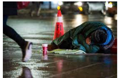
Figure 1: Clients without access to telephones, internet and homes face barriers accessing justice sector services. The Embedded Counsel Project is designed to remove them.

Holistic defenders also address the underlying issues that brought an accused person in contact with the criminal justice system 2 .