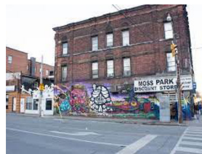
Figure 2: A high proportion of residents in Moss Park are involved in the criminal justice system and face poverty, homelessness, mental health and addictions disabilities.

Public legal education, community outreach and secondary consultations with service providers build community trust.