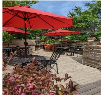
Figure 3: Picture of one of the outdoor patios onsite. The LAO Staff Lawyer meets with clients and conducts public legal education sessions in the spaces.

Holistic defence is a promising practice and there have been positive reports that it results in better case outcomes 4 . This model helps to ensure that the negative impacts of criminal justice sector involvement are minimized 5 . Merely being charged with a crime can trigger negative civil legal consequences and can contribute to a cycle of homelessness and incarceration 6 . The number of homeless individuals in Ontario's provincial jails continues to grow annually 7 .